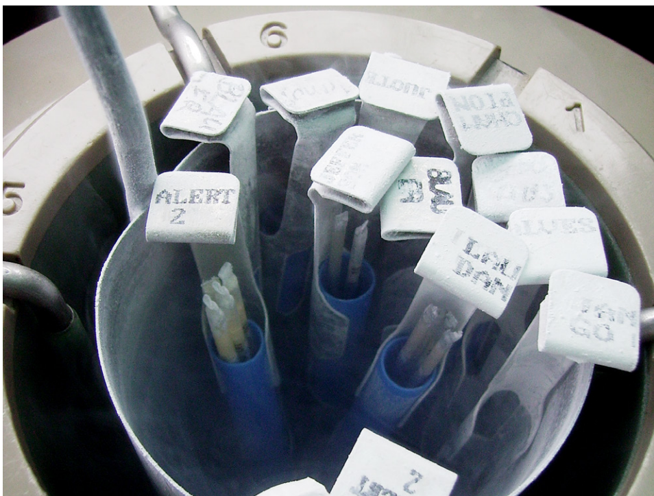
Ampoules of frozen bovine semen in liquid nitrogen canister (source: © 2008 Wikimedia.org/Uwemuell).

Many genotyping platforms now exist (Berry et al., 2013) to simultaneously generate sufficient genomic information for imputation to higher genotype density for use in genomic evaluations while also providing genomic information for parentage and breed verification or assignment. These genotype platforms can also aid in the monitoring of variants in major genes or genes conferring lethal or congenital defects, as well as quantifying the contribution of (genotyped)