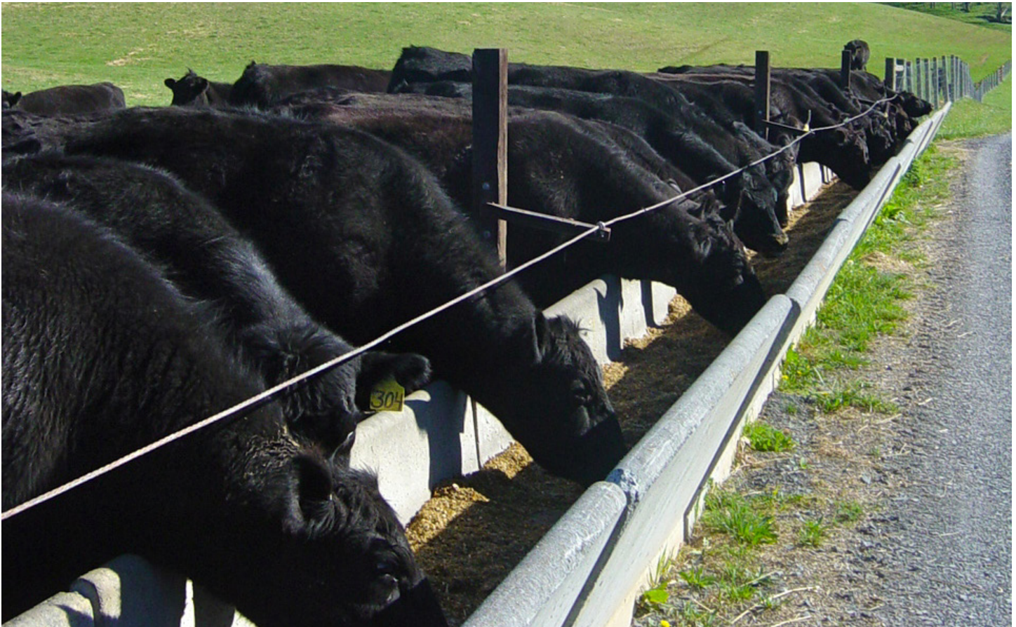
Sugar Loaf Farm Black Angus Cattle.