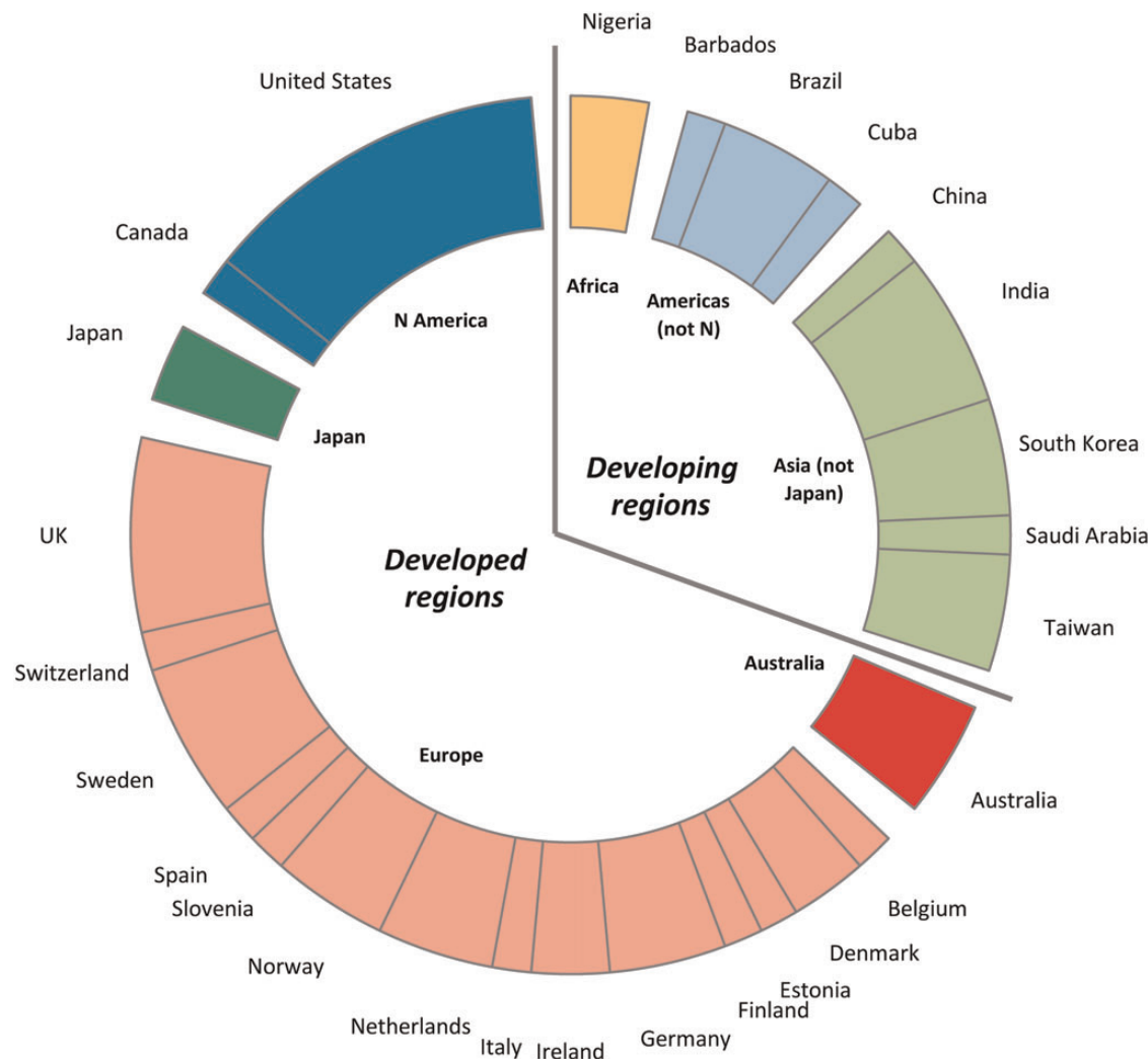
Figure 1. Country setting of included samples by UN region. The chart shows the country setting of the 63 included samples, grouped by UN region.