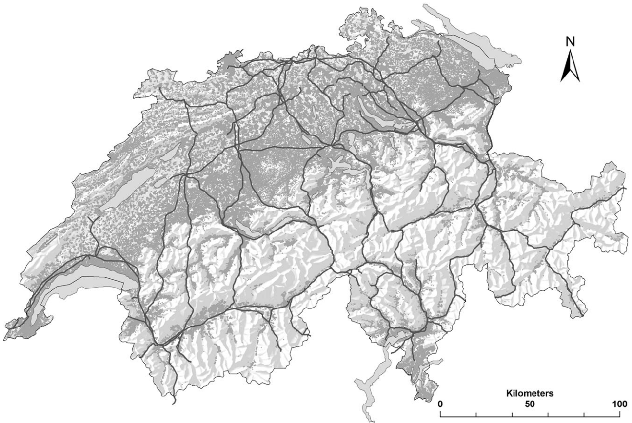
Figure 1. Power lines and buildings in Switzerland. Data sources: Federal Inspectorate for Heavy Current Installations, Fehraltdorf (power lines); Register of Buildings and Dwellings, Federal Statistical Office, Neuchâtel (building coordinates); and Federal Office of Topography swisstopo, Wabern (background map of Switzerland).

We used age as the underlying timescale in our models. All models were adjusted for sex; educational level (compulsory education, secondary level, and tertiary level); highest reported occupational attainment by code (4 levels extracted from the International Standard Classification of Occupations of 1988—1) legislators, senior officials, managers, and professionals, 2) technicians and associate professionals, clerks, service workers, and shop and market sales workers, 3) skilled agricultural and fishery workers, craft and related trades workers, plant, machine operators, and assemblers, and elementary occupations, and 4) no occupation reported); civil status (single, married, divorced, widowed); urbanization category (city, agglomeration, rural municipality); and language region (German, French, Italian). We also included the number of apartments per building into the model, a potential risk factor for magnetic field exposure due to indoor wiring (8).