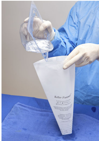
Figure 1. The silicone implant may be directly poured from its packaging into the mouth of the funnel, without handling of the implant.