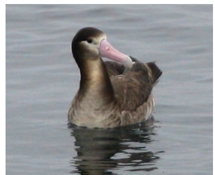
Long-line fishing continues to threaten fish- and squid-eating birds. Short-tailed albatrosses attempt to grab fish bait on the wing but get hooked and eventually drown. Newly designed long-line gear, pioneered by Ed Melvin, of Washington Sea Grant, has substantially reduced albatross bycatch in Alaska.