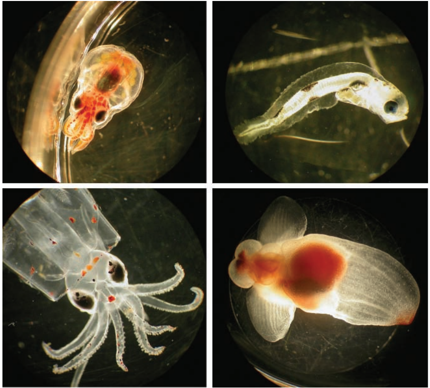
Zooplankton are organisms that drift, unable to propel themselves against currents, and include larval forms of many species—octopus (top left), pollock (top right), and squid (bottom left)—as well as animals that live their whole lives as plankton, such as sea angels which are tiny gastropods (bottom right).