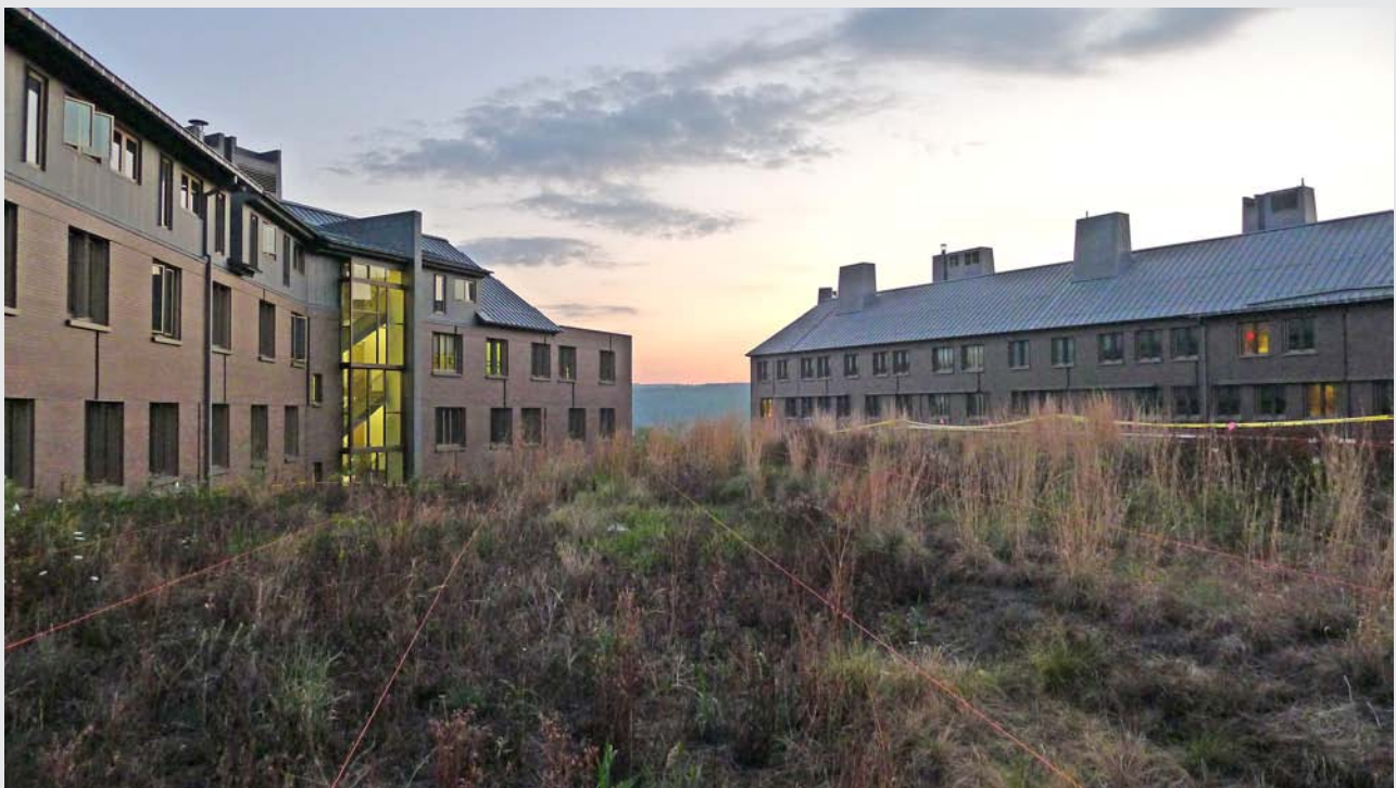
Figure 2. Green roofs are an increasingly prevalent type of urban green spaces within cities throughout the world, but their ability to support multiple taxa and connect with other green spaces is largely unstudied. of a green roof at Cornell University (Ithaca, NY).

For highly mobile insect species such as bees and weevils, the number of green roofs within an area increases their connectedness as a habitat type (Braaker et al. 2014). Still, with increasing building height, any taxa able to reach the top of a building could have difficulty getting down. Moreover, green roofs on taller buildings experience increased exposure to wind and solar radiation, further limiting their value as habitat. For example, bats were shown to use green roofs as foraging areas in London, United Kingdom, preferring low-rise buildings with “biodiverse” plantings (Pearce and Walters 2012). Thus, green roofs that are small and isolated from ground level may result in the creation of urban green space devoid of biodiversity, or worse, as ecological traps attracting local taxa to a difficult environment (MacIvor 2016).