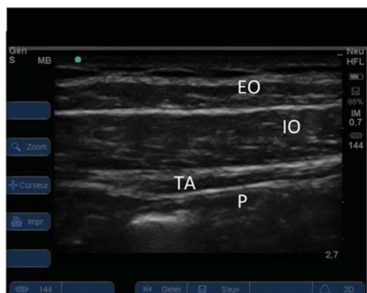
Fig 1 Sonographic view of the three lateral abdominal muscles layer obtained with a 13–6 MHz linear transducer. The orientation of the probe was perpendicular to a line joining the anterior superior iliac spine and the inferior rib to obtain a transverse view of the abdominal layers. EO, external oblique; IO, internal oblique; TA, transversus abdominis; P, peritoneum.