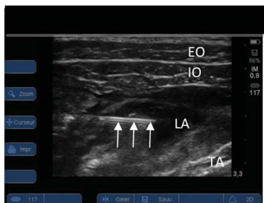
Fig 2 Sonographic view of a TAP block injection with the needle (arrows) advanced using an in-plane approach with the tip introduced between the aponeurosis of transversus abdominis (TA) and internal oblique (IO) muscles. LA, local anaesthetic.