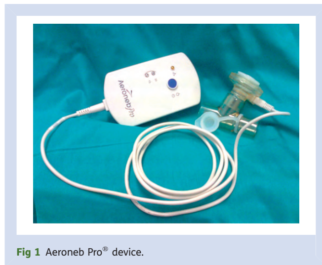
Fig 1 Aeroneb Pro ® device.

Patients were premedicated with diazepam 5–7 mg, 30 min before surgery. General anaesthesia was induced with