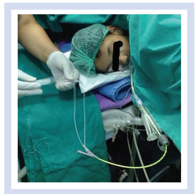
Fig 1 EZ-Blocker in position.

ventilation procedure was repeated. During anaesthesia, blood gas samples were obtained and neither hypercarbia nor hypoxia occurred at both sides of single-lung ventilation. Video-assisted thoracic surgery was successfully performed and the surgeon satisfaction was very good. The patient was extubated without complications and transferred to the post-operative anaesthesia care. No discomforts like sore throat or minor injuries at the trachea were detected. We think that the development of a smaller EZ-Blocker could help anaesthetic management for paediatric thoracic surgery a lot and further clinical studies could improve EZ-Blocker administration.