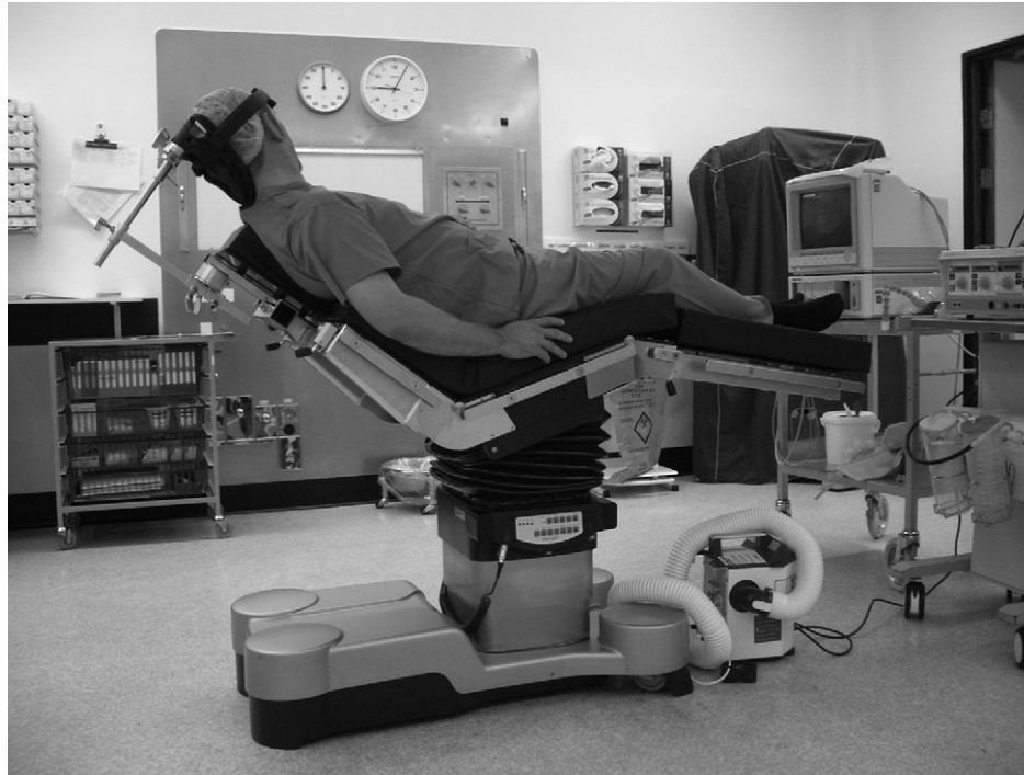
Fig 3 The modified deck-chair position.

Patients in the deck chair position are prone to hypotension, mainly due to venous pooling in the extremities and lack of surgical stimulation with an effective block. The angle of elevation from the waist should be increased slowly in the compromised patient, thus allowing time for haemodynamic equilibration. Intra-operative cerebral ischaemia has been reported, probably through changes in cerebral blood flow from a combination of postural hypotension and excessive head and neck manipulation. 7 The Bezold-Jarisch reflex may be activated during shoulder surgery in the deck-chair position, especially when surgery is performed under interscalene block. This presents as sudden, profound bradycardia and hypotension, which can rapidly progress to cardiac arrest. However, the role of the reflex in these dramatic haemodynamic changes has recently been called into question. 8