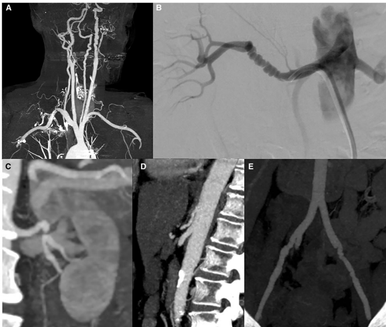
Figure 1 Examples of FMD lesions in various arterial beds. (A) Multifocal stenosis of the right internal carotid artery, of the left vertebral artery and of the left internal carotid artery. (B) Multifocal stenosis of the mid–distal segment of the right renal artery. (C) Severe focal stenosis of the distal segment of the left renal artery. (D) Multifocal stenosis of the coeliac trunk. (E) Bilateral multifocal stenosis of iliac common arteries.

Compared to younger patients, patients \geq 65 years old at diagnosis of FMD had more often multifocal FMD (85% vs. 71%, P value = 0.002 ) and