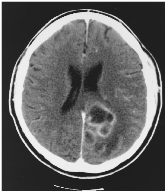
Figure 1. CT scan with intravenous contrast of the brain of a 47-year-old diabetic male who presented with headache and right-sided hemiparesis; an irregular 4.0 \times 5.0-cm ring-enhancing lesion is evident in the left occipital lobe, consistent with a brain abscess.

Careful culturing of abscess material obtained at the time of surgery provides the best opportunity to make a microbiological diagnosis. When meticulous attention is paid to the proper handling of clinical specimens, the culture yield has approached 100% in some studies [11, 14]. This result is related to improved anaerobic transport techniques and prompt plating of infected material on appropriate culture media [15, 16]. A patient's clinical condition sometimes requires institution of ther-