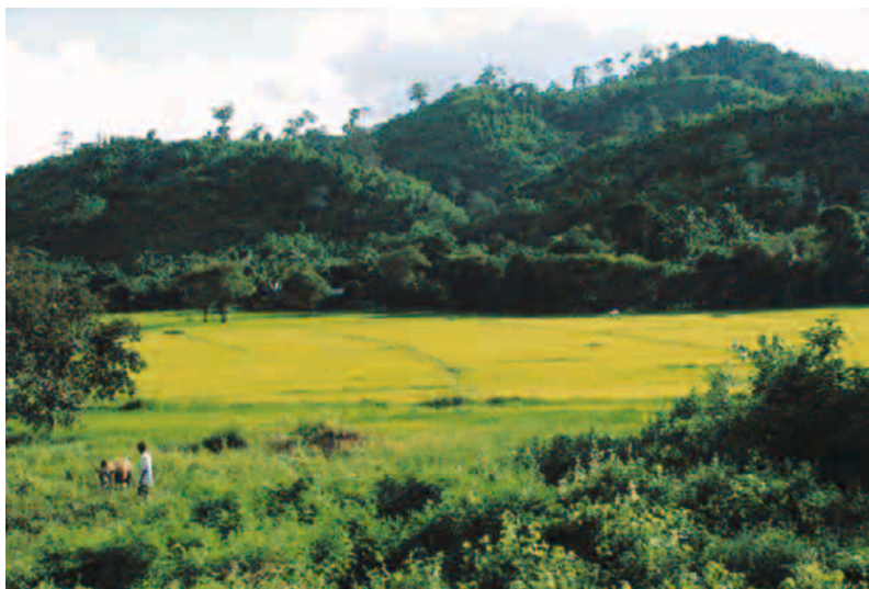
Figure 4. Typical area of scrub typhus endemicity in Thailand

In addition to the 4 diseases discussed above, another 5 rickettsioses have been sporadically reported in international travelers. Common features for these rarely reported diseases include one or several of the following: their areas of endemicity are restricted to remote settings or to extreme biotopes infre-