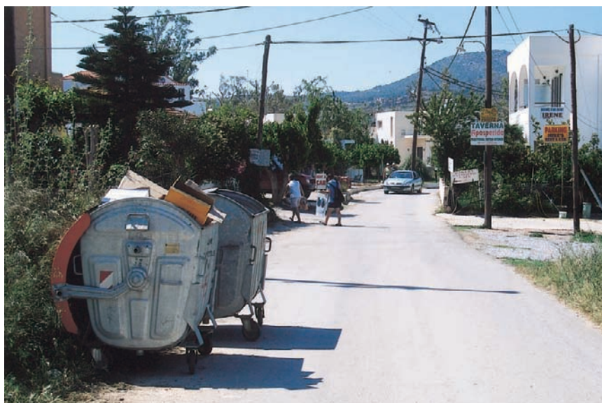
Figure 1. A road with litter (and rodents) in a Mediterranean holiday resort—a typical area of murine typhus endemicity

frequently occurs in clusters—an important epidemiological feature—and may sometimes present as large and spectacular outbreaks among safari tourists, military personnel, game hunters, sports participants, or school students [19, 21, 22]. The incidence of African tick bite fever among short-term safari tourists may be impressive (4%–5.3%) and widely exceeds those reported for other tropical fevers among short-term visitors to sub-Saharan Africa. Identified risk factors include game hunting, travel during the summer season, and travel to southern Africa, where the