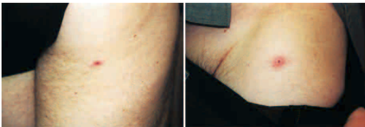
Figure 3. Multiple inoculation eschars in a male traveler with African tick bite fever

where an estimated 1 million cases occur each year, mainly among humans engaged in logging, clearing of land, and working in rice fields (figure 2). Military personnel are also at risk, and scrub typhus had a significant impact on troops during World War II and the Vietnam War. The disease is caused by Orientia tsutsugamushi , which is transmitted by the bites of larval trombiculid mites (chiggers). The larvae typically bite humans on the lower extremities or in the genital region (where they may be difficult to recognize). More than 80% of patients present with fever and a generalized lymphadenitis, and 50% have an inoculation eschar. Many cases are mild, but if left untreated, pneumonitis, meningoencephalitis, disseminated intravascular coagulation, or renal failure are commonly seen. The fatality rate of scrub typhus ranges from 1%–35%, depending on the virulence of the infecting strain, host factors, and treatment [24].