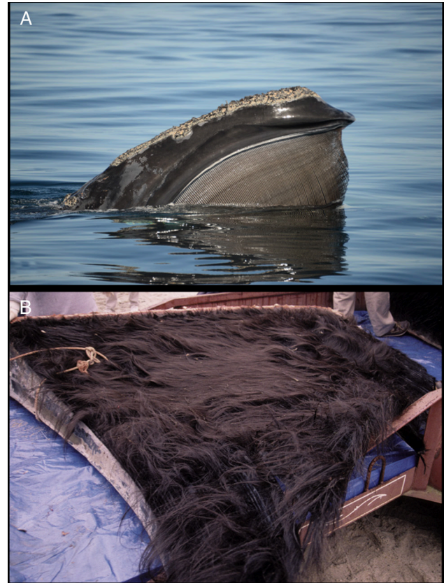
Figure 1: Baleen of North Atlantic right whales (NARW). (A) Rostrum of a living NARW, displaying edges of parallel baleen plates as used during filter-feeding of small prey near the water surface. (B) Excised baleen rack, showing the filament 'fringe' on the medial surface of baleen plates from an adult female NARW (Female 2 of this study).