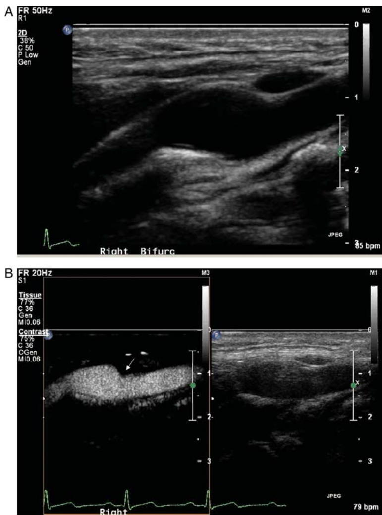
Figure 1 Assessment of subclinical atherosclerosis using standard carotid ultrasound and CEUS. (A) B-mode still frame of the right carotid artery. On the image, the distal CCA, bifurcation, and proximal ICA are visible (from right to left). No atherosclerotic plaques were detected. (B) Corresponding combined B-mode and CEUS still frame. An atherosclerotic plaque is visible on the contrast-enhanced still frame. It is located in the distal CCA and bifurcation (white arrow).

Statistical analysis was performed using SPSS PASW software for Windows (Version 17.0.2, SPSS Inc., Chicago, IL, USA). Continuous data were expressed as mean ± standard deviation, and categorical variables were expressed as counts and percentages and/or median value. McNemar’s test was used to compare between groups. Intra- and inter-observer reproducibility for the assessment of CIMT and atherosclerotic plaque was calculated using Pearson’s correlation and \kappa -statistics. A value of P < 0.05 was considered statistically significant.