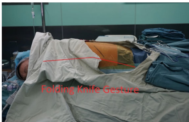
Figure 1: The patient position during single-port video-assisted thoracoscopic surgery.

Clinical information from all included patients was collected from the institution's database by trained surgical coordinators. All data collected were tabulated using Microsoft Excel for further analysis.