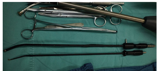
Figure 2: The designed surgical instruments for single-port video-assisted thoracoscopic surgery.