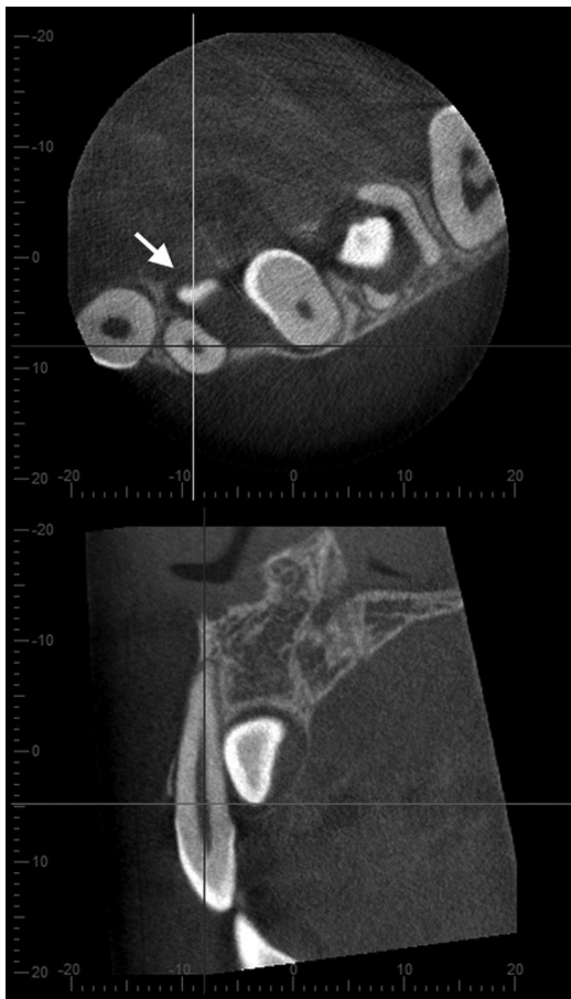
Figure 2 Vertical location of the cuspid tip (arrow) in relation to the long axis of the neighbouring lateral incisor on sagittal and axial CBCT scans, representative example.