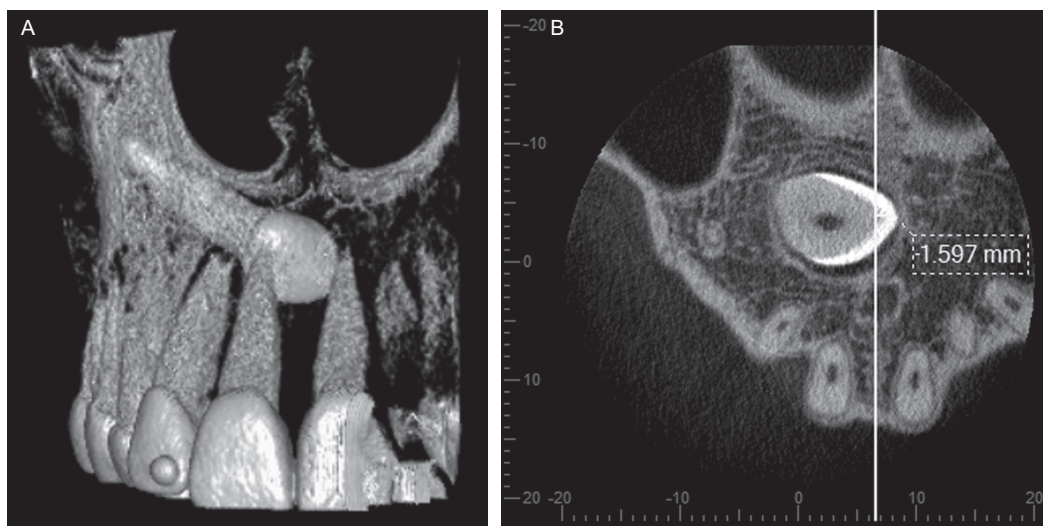
Figure 5 Representative example of an impacted canine crossing the maxillary midline (A: volume rendered image and B: axial CBCT scan).

(range: 8.7–77.2 years, SD \pm 13.65 years). Of the 113 included patients, 39 (34.51 per cent) were male and 74 (65.49 per cent) were female (Table 1). Unilateral impaction was present in 92 patients (81.4 per cent), and 21 patients (18.6 per cent)