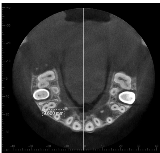
Figure 3 Example of transverse measurement of the distance between the canine cuspid tip in relation to the maxillary midline on an axial CBCT scan.

coronal and axial CBCT slices. Distances greater than 3 mm were considered to be an enlarged follicle (Ericson et al. , 2001).