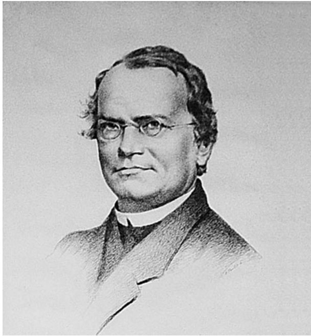
Figure 2 Gregor Mendel: progenitor of Mendelian randomization.