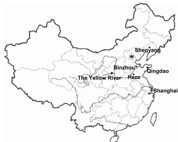
FIG. 1. Geographical distribution of the regions in China investigated in the present study. The three regions with normal iodine contents in drinking water are Shenyang, Shanghai, and Qingdao. Binzhou and Heze are close to the Yellow River and have very high iodine contents in drinking water.

Representative regions in China in which iodine contents in natural drinking water ranged from normal to high were chosen for the present study, including Shenyang, Shanghai, and Qingdao, where iodine contents in drinking water were documented to be normal (10–21 µg/liter), and Binzhou and Heze in the close vicinity of the Yellow River and Old Yellow River, where iodine contents in drinking water were high (104–287 µg/liter) (Fig. 1 and Table 1) (17–23). Urinary iodine levels in individuals living in these regions were documented to be correspondingly normal or high (17, 18, 20, 23, 24) (Table 1). None of these regions has