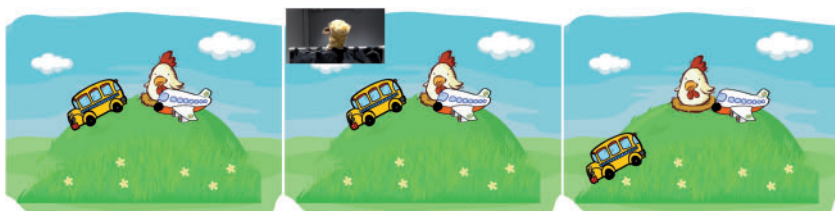
Figure 1 The three stages of an example trial, accompanying the test sentence The hen pushed (either) the bus or the airplane . SCENE 1: There once was a hen who loved to play with her toys, and she especially loved to push them around! One day her papa gave her two new toys: a bus and an airplane! The hen was very happy to play with them. Let's see if Raffie can guess what happened next! SCENE 2: EXPERIMENTER: Raffie, tell us, what happened next? PUPPET: The hen pushed the bus or the airplane. EXPERIMENTER: Let's see if Raffie's right! SCENE 3: (following animation of hen pushing the bus down the hill) Look, the hen pushed that one! Did Raffie guess right?

outcome of the story was such that both disjuncts were verified, for example, the hen would push both the bus and the airplane.