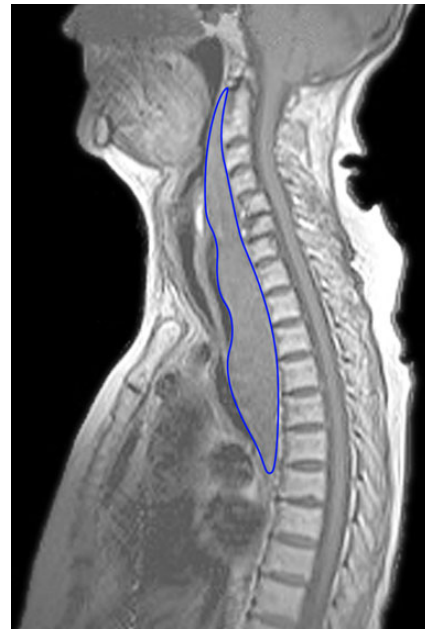
Figure 2: MRI showing the elongated retropharyngeal mass anteriorly of the spine, compressing the trachea and esophagus. The mass starts at the level of the second cervical vertebra and expands into the posterior mediastinum until the level of the seventh thoracic vertebra. Length of the hematoma is 200 mm with an anterior–posterior diameter of 33 mm. Compression of the trachea to a minimal diameter of 3 mm.

After this event, calcimimetic drug therapy was continued, and blood calcium and PTH levels remained within the normal range. Hence, autoperathyroidectomy was suspected and surgery was cancelled. After 4 months, however, calcium and PTH levels increased again. On parathyroid scintigraphy and SPECT scan, a small area at the right lower thyroid lobe showed increased activity, again suspicious for a parathyroid adenoma. Since the patient experienced symptoms of hypercalcemia,