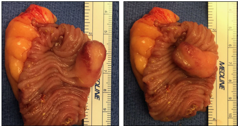
Figure 2: Resected small bowel with intraluminal lipoma.

characteristics of a lipoma (Fig. 2). Pathologic evaluation of the specimen showed a 1.5 \times 1 \times 1 \text{ cm}^3 submucosal lipoma with a small area of overlying ulceration and no evidence of malignancy (Fig. 3). The rest of her hospital course was complicated by a fascial dehiscence requiring retention suture placement. She was discharged on post-operative Day 18.