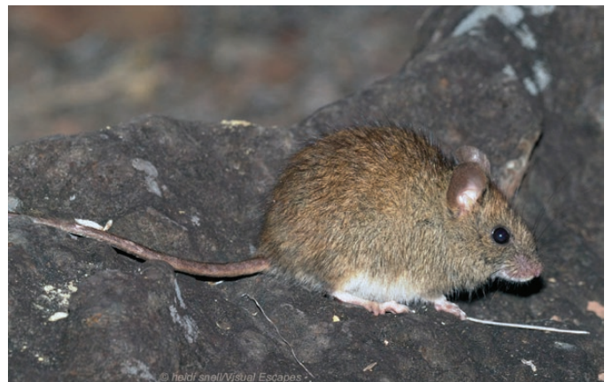
Fig. 1. —An adult of Aegialomys galapagoensis from Santa Fé Island (Barrington Island), Galapagos, Ecuador.

CONTEXT AND CONTENT. Order Rodentia, family Cricetidae, subfamily Sigmodontinae, tribe Oryzomyini, genus Aegialomys . The subfamily Sigmodontinae is a monophyletic lineage, comprising 11 tribes (sensu Salazar-Bravo et al. 2016) and 86 genera (sensu D’Elía and Pardiñas 2015). The tribe Oryzomyini is also a monophyletic group (sensu Weksler 2006), and currently comprises 29 genera and 140 species (Pardiñas et al. 2017), occurring from the southeastern portion of the United States to southern Chile and Argentina. The species of the genus Aegialomys are