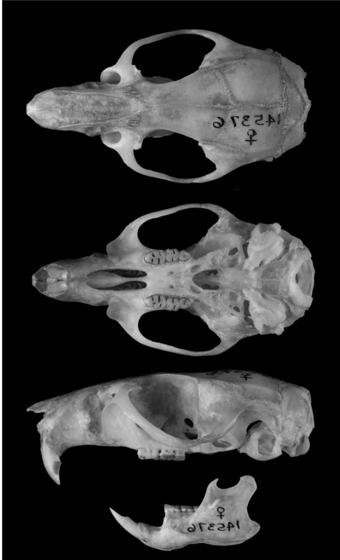
Fig. 2. —Dorsal, ventral, and lateral views of skull and lateral view of mandible of an adult female Aegialomys galapagoensis (MVZ [the Museum of Vertebrate Zoology at Berkeley] 145376) from Santa Fé Island (Barrington Island), Galapagos, Ecuador. Occipitonasal length is 35.23 mm.