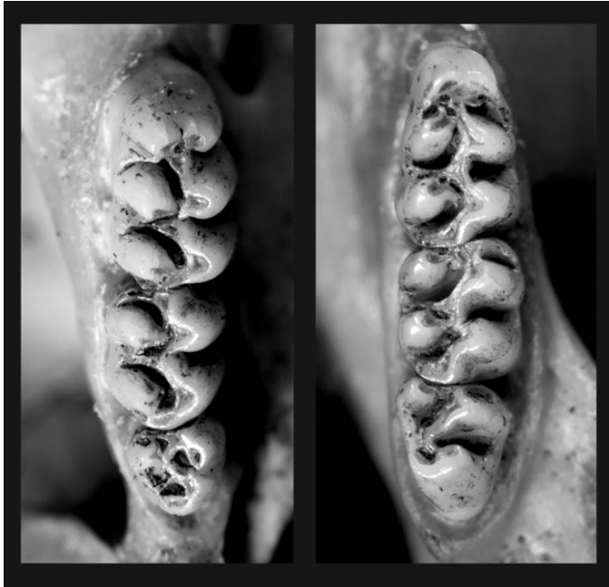
Fig. 4. —Occlusal view of the maxillary and mandibular molar rows of Aegialomys galapagoensis (MVZ [the Museum of Vertebrate Zoology at Berkeley] 125470) from Santa Fé Island (Barrington Island), Galapagos, Ecuador.

Aegialomys galapagoensis is a terrestrial species with some scansorial abilities.