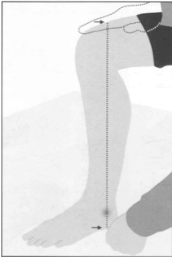
Fig. 2. Estimating height from knee height (permission from MAG BAPEN, www.bapen.org.uk). Source: Malnutrition Advisory Group (MAG) British Association of Enteral and Parenteral Nutrition (BAPEN), 2003 (www.bapen.org).

Ideal body weight estimation (Tables 4 and 5).