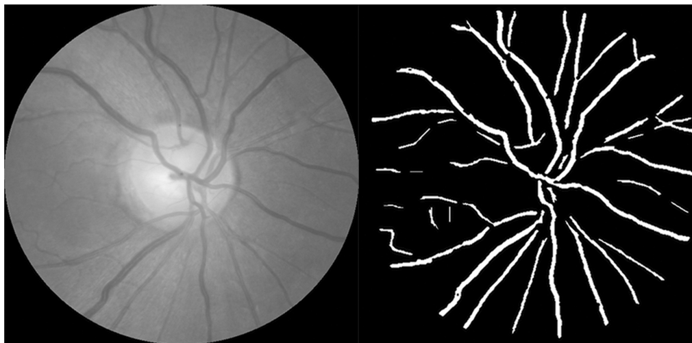
(b) shows a Df of 1.4541