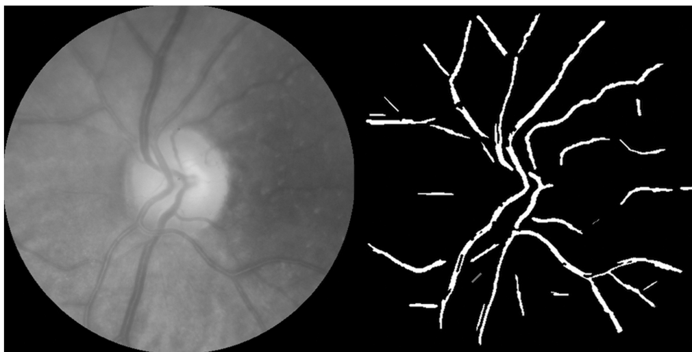
(c) shows a Df of 1.4073