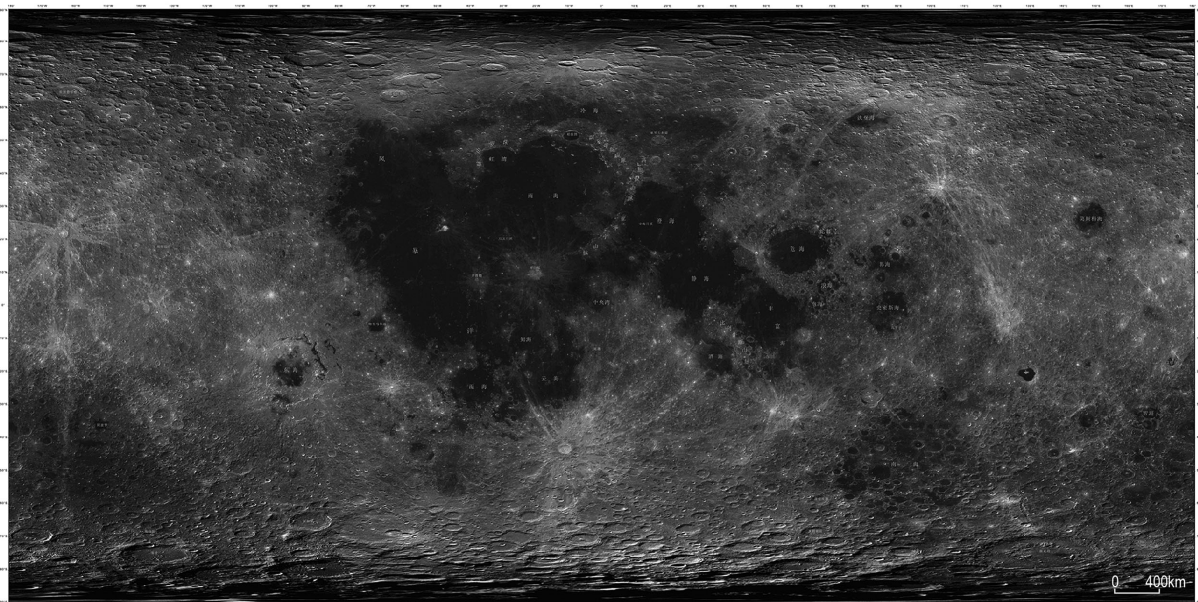
A lunar global topographic map produced using CE-2 image data. The spatial resolution is 7 m. The near-side of the Moon is presented in the middle and the far-side is presented on the right and left side of the map.