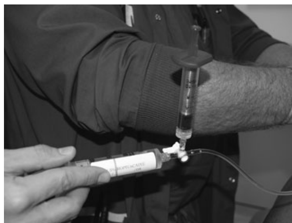
Figure 2 Application of ADS device for PVB.

After demonstration of adequate blockade by loss of sensation to pinprick and temperature sensation 20 minutes following block placement, the patient was transported to the operating room for surgery. The patient received an additional 2 mg midazolam and 100 µg fentanyl, and was placed on