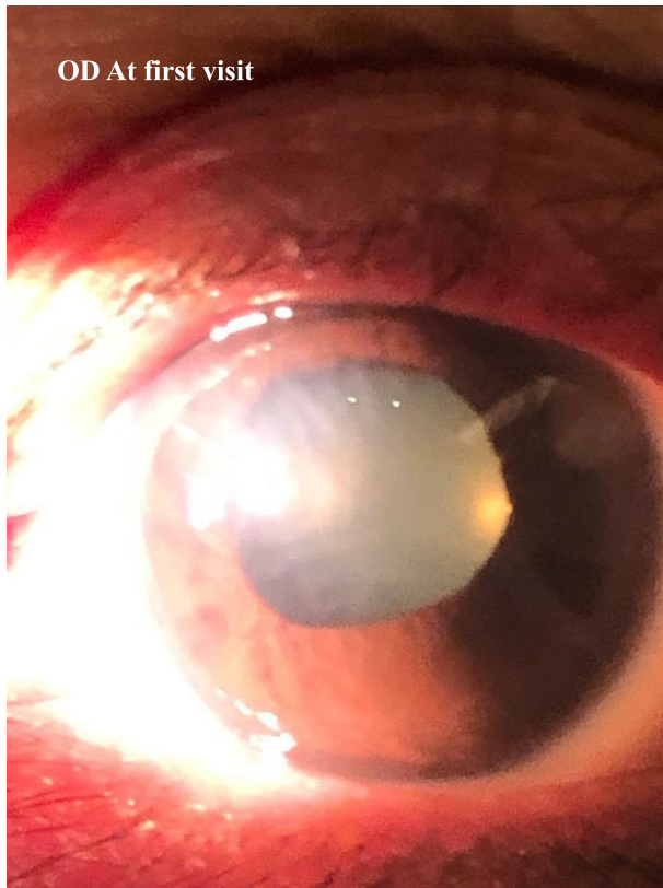
Figure 1. Slit-lamp photograph of the right eye at presentation showing conjunctiva hyperemia and corneal edema.

morning and 250 mg every night, and continued the same eye medications. In a follow-up visit 5 days later (Fig. 2), the IOPs were reduced to 11 and 14 mmHg, respectively. The best corrected visual acuities (BCVAs) were 0.1 OD and 0.4 OS. The patient had a refraction status of +4.50 diopter -1.00 \times 160^\circ , OD, and +3.00 diopter -0.25 \times 57^\circ , OS. A slit lamp examination revealed hazy corneas with edema and descemet membrane folds, pigment deposits on the anterior lens surface, anterior chambers were deep and quiet, OU. Fundus examination showed some disc hyperemia, OU. Three weeks later, the BCVAs were 0.4 and 0.6, respectively. IOPs were normal at 15 and 14 mmHg, respectively. Slit lamp examination revealed transparent corneas, deep and quiet anterior chambers (Fig. 3). The patient was advised to continue anti-glaucoma medications and return for a follow-up in 1 month.