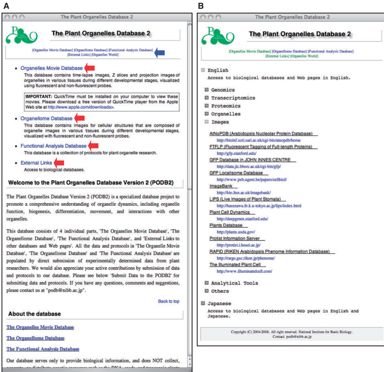
Fig. 1 The graphical user interface for the homepage of PODB2 and the external links page. (A) Four individual parts, the organelles movie database, the organelle database, the functional analysis database and a compilation of external links, are included in PODB2. Users can access the three databases and external links by clicking on each term located on the updated homepage (red arrows) and at the top of each page in the database (blue arrow). (B) On the external links page, each link is categorized into seven subgroups. Each link is accessed by clicking on the square button to the left of the category name. The Japanese flag icon represents the link to the website that is depicted in Japanese.

(blue arrow in Fig. 1A ), allows users to toggle between these two websites.