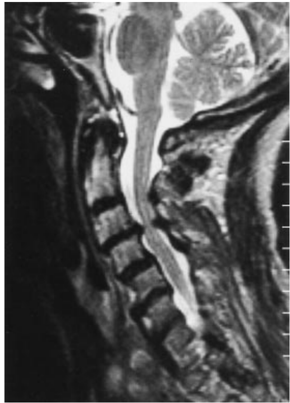
Figure 3. Sagittal T 2 -weighted (TR 3000 ms, TE 90 ms) MRI scan of the cervical spine, showing marked cervical spondylosis with spinal cord compression at C3/4 causing cervical myelopathy.