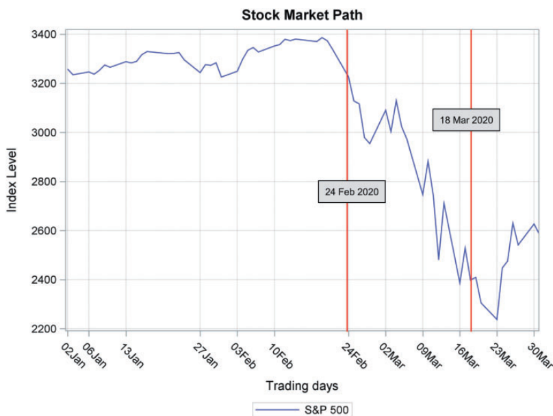
Figure 1 S&P 500 during the first quarter of 2020

This figure plots the stock market path of S&P 500 during the first quarter of 2020. The vertical lines represent the two event dates.