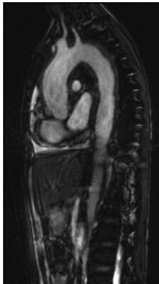
Fig. 1 14 2/12-year-old girl with TA. MRI: sagittal oblique section: pronounced thickening of the aortic wall in its entire length Ectasia of the ascending aorta, aortic arch and descending aorta.

MRA is a less invasive imaging technique. It can provide calculated, non-dynamic blood flow information. Its strength is that MRA provides important additional information about the vessel wall. Mild inflammation of the wall without associated significant stenosis will be missed by conventional angiography but may be picked up by MRA [87, 88]. Axial T_1 -weighted MRA best demonstrates abnormal wall thickening of the vessels. The inflammatory oedema of the wall causes a bright T_2 -weighted signal. Contrast-enhanced MRA further depicts vessel wall irregularity (Fig. 1). Focal TA disease activity can be determined in contrast-enhanced MRI, which has been shown to correlate with clinical and laboratory findings in some patients [88]. Designated 'oedema-weighted' images in MRI detect fluid, representing inflammation, within the vessel wall. Evidence of new anatomical lesions with evidence of vessel wall oedema is thought to represent active disease [91]. Clinical and laboratory features plus