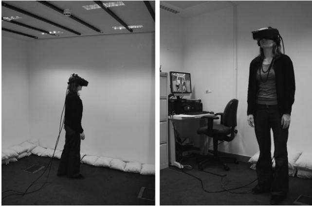
Fig. 1. Pictures From the Author's Virtual Reality Laboratory.

give a presentation in front of a positive, neutral, or negative virtual audience. The audience contained 8 characters ("avatars"). Participants were clearly affected by their audience. They generally responded favorably to the positive audience (eg, "It was clear that the audience was really positive and interested in what I was saying and it made you feel like telling them what you know") and were put off by the negative audience (eg, "I was upset, really thrown. I totally lost my train of thought."). Higher levels of anxiety toward the virtual audience were associated with public speaking fears, which is expected if virtual audiences elicit similar responses to real audiences. Anticipation of giving a speech in front of a virtual audience has been shown to elicit startle reactivity as assessed by eyeblink, heart