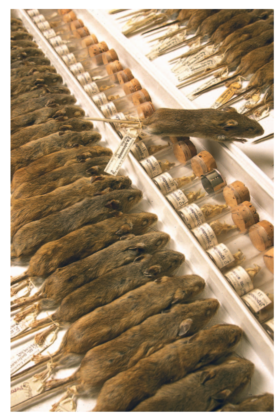
Museum collections of small mammals have been used to identify reservoirs of hantavirus (Yates et al. 2002), reconstruct community structure in relation to habitat modification (Pergams and Nyberg 2001), and even build a predictive framework for crop pests (Sanchez-Cordero and Martinez-Meyer 2000).

damage caused by invaders run in the billions of dollars (Pimentel et al. 2000). Museum collections have been used to determine the current distributions of invaders, identify the source of introduced populations, reconstruct rates of spread, and gauge the ecological impact of invaders (e.g., Mills et al. 1996, Davies et al. 1999, Fonseca et al. 2001, Suarez et al. 2001). In a recent study, Suarez and colleagues (2001) used museum collections to reconstruct the spread of the invasive