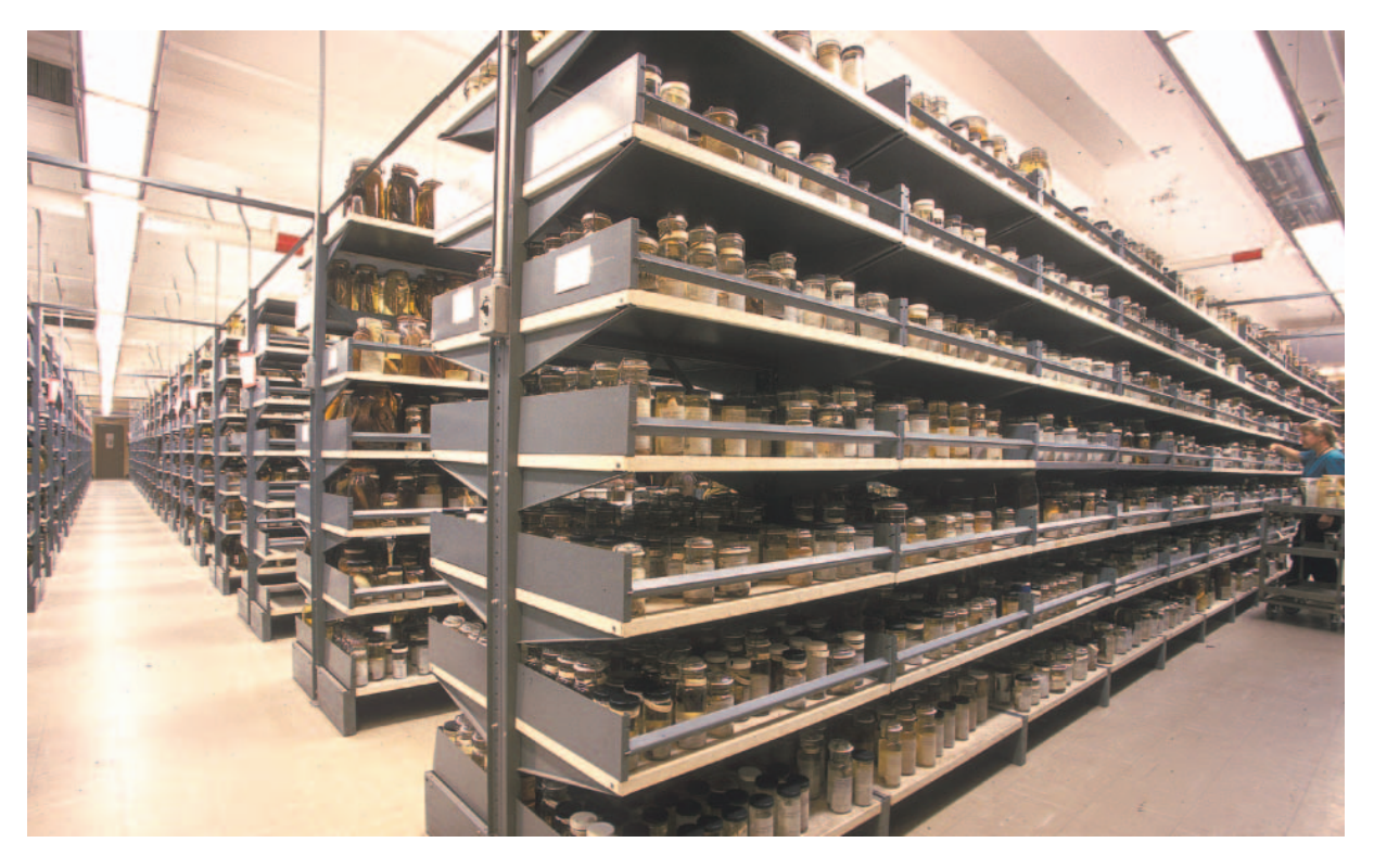
A section of the fish collection at the National Museum of Natural History (Smithsonian Institution). Stored specimens such as these have allowed scientists to reconstruct the history of contaminants (such as mercury) in our food supply (e.g., Barber et al. 1972, Miller et al. 1972).

For example, Dunn and Winkler (1999) examined 3450 nest records of tree swallows ( Tachycineta bicolor ) in North America (from a survey of over 21,000 nest record cards in museums, universities, and ornithological societies) and found that the egg-laying date advanced by about 9 days between 1959 and 1991, most likely as a result of higher air temperatures during the spring breeding season.