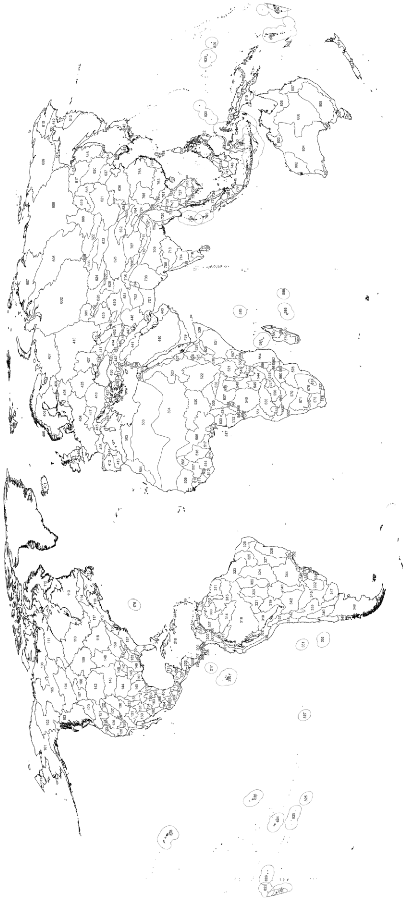
Figure 1. Map of freshwater ecoregions of the world, in which 426 ecoregions are delineated. An interactive version of this map that includes additional information is available at www.feoww.org .