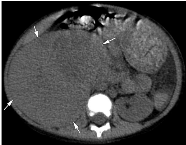
Fig. 2. Abdominal computed tomography scan of Twin A at the age of 3.49 years, showing Wilms' tumor in right kidney (arrows).

903A > G and IVS7-32C > A, suggesting that they were monozygotic twins.