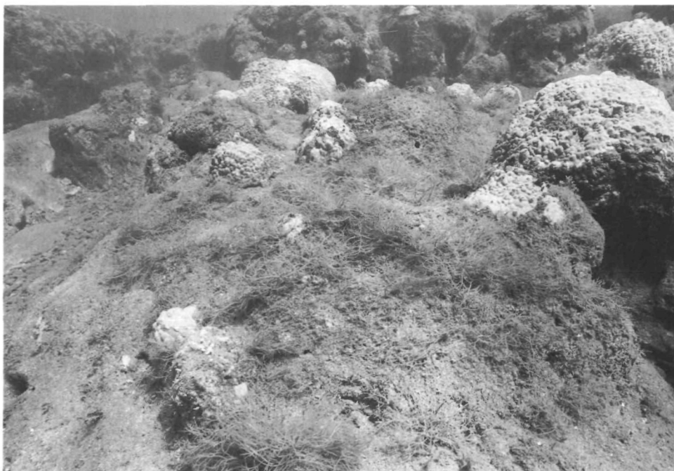
FIG. 4. Nutrient input caused an increase in fleshy algae biomass, which is now binding the sediment, preventing normal turbulence from cleansing the reef of accumulated sediment.

of sewage input, eroding the carbonate structure of the reefs and undermining the base upon which coral recolonization took place following sewage diversion.