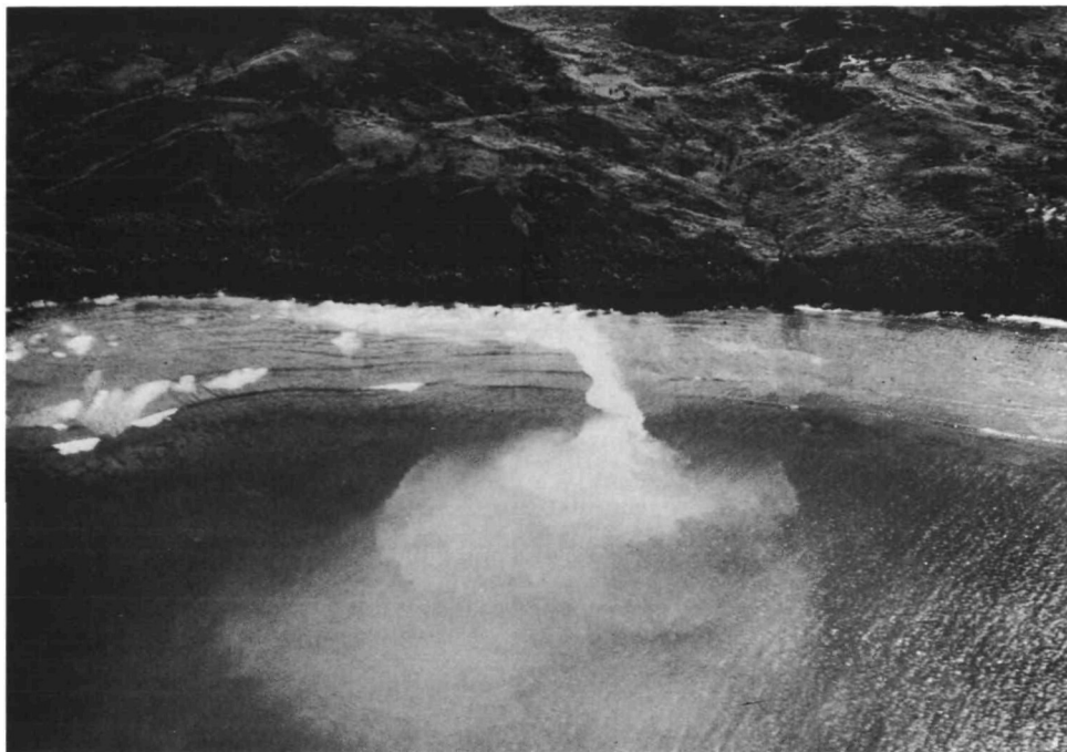
FIG. 1. Sediment plume off Southern Guam. Corals up to several hundred years old were killed by sediment burial. Water samples from plumes like this were found to cause up to an 86% drop in fertilization rates in spawning corals. The plume is ca. 1 km in diameter.

surface water quality above reefs during coral spawning events was sufficiently reduced to cause reproductive failure. Considering most coral species spawn once a year, during the rainy season when coastal pollution would be expected to reach its peak, and that most coral eggs are buoyant, floating in the surface water layer for up to several hours before fertilization occurs, it is easy to see the link between terrigenous runoff and reproductive failure of spawning reef species. Furthermore, chemical cues have been found to allow synchronization of spawning in corals (Atkinson and Atkinson, 1992; Richmond, unpublished). Decreased water quality could also affect these critical cues, preventing synchronous release of gametes and resulting in lowered reproductive success.