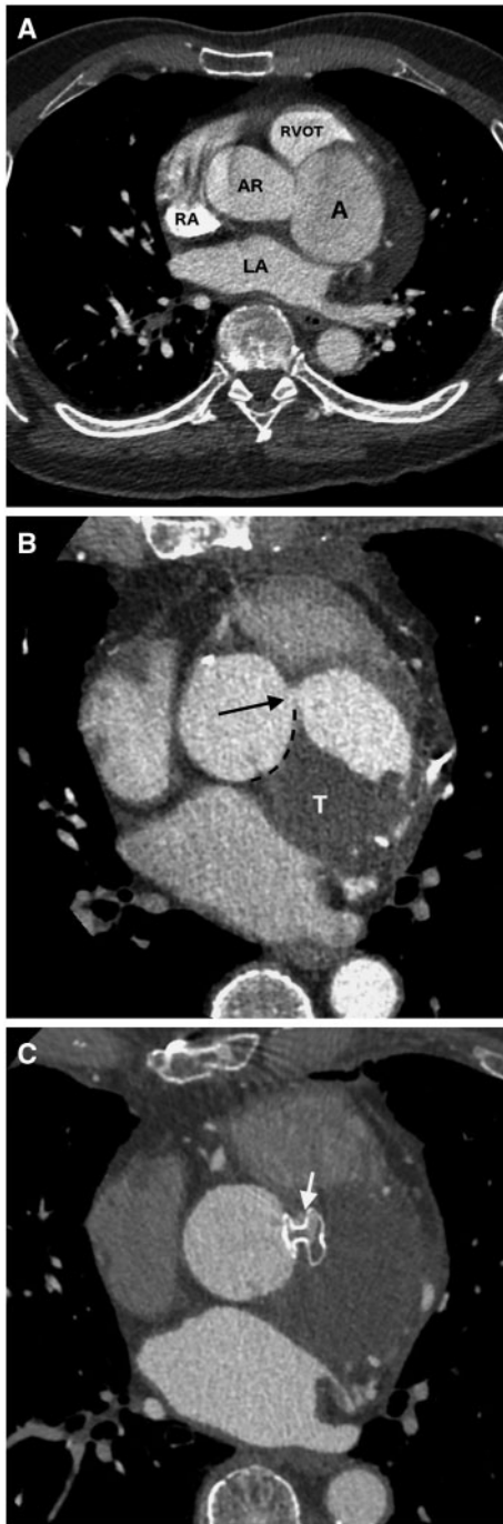
Figure 2: (A) Cardiac computed tomography angiography (CCTA) showing the aneurysm (A) originating from the left coronary sinus. Note the very thin septum between the aneurysm and the right ventricular outflow tract (RVOT). Postoperative CCTA 2 (B) and 5 months (C) after surgery. (B) Axial view demonstrating the leak (arrow) at the anterior border of the patch (dotted line) used to close the aneurysm with only partial thrombosis (T) of the aneurysm lumen. (C) Same view after the implantation of the Amplatzer septal occluder showing a very small residual leak (arrows). AR: aortic root; LA: left atrium; RA: right atrium.

aneurysm and surrounding tissues (Fig. 2A). The patient received a diagnosis of left sinus of Valsalva aneurysm and subsequently underwent surgical endoaneurysmorrhaphy under extracorporeal circulation using a Dacron patch ( 3 \times 2 \text{ cm}^2 ) to close the opening of the aneurysm, thereby reconstructing the left coronary sinus. Due to preoperative myocardial ischaemic symptoms, 3