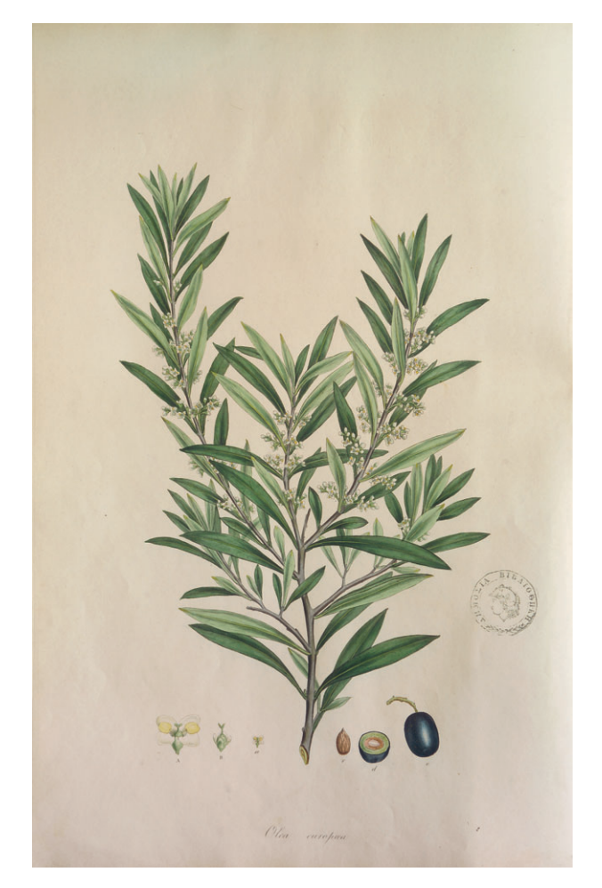
Fig. 1. Olea europaea L.: a drawing by Ferdinand Bauer in Flora Graeca Sibthorpiana (reproduced with permission of the National Library of Greece), produced between 1787 and 1794.

from ashes in the garden of Gethsemane. It may be in the spirit of peace that olive branches appear on the flag of the United Nation Organization.