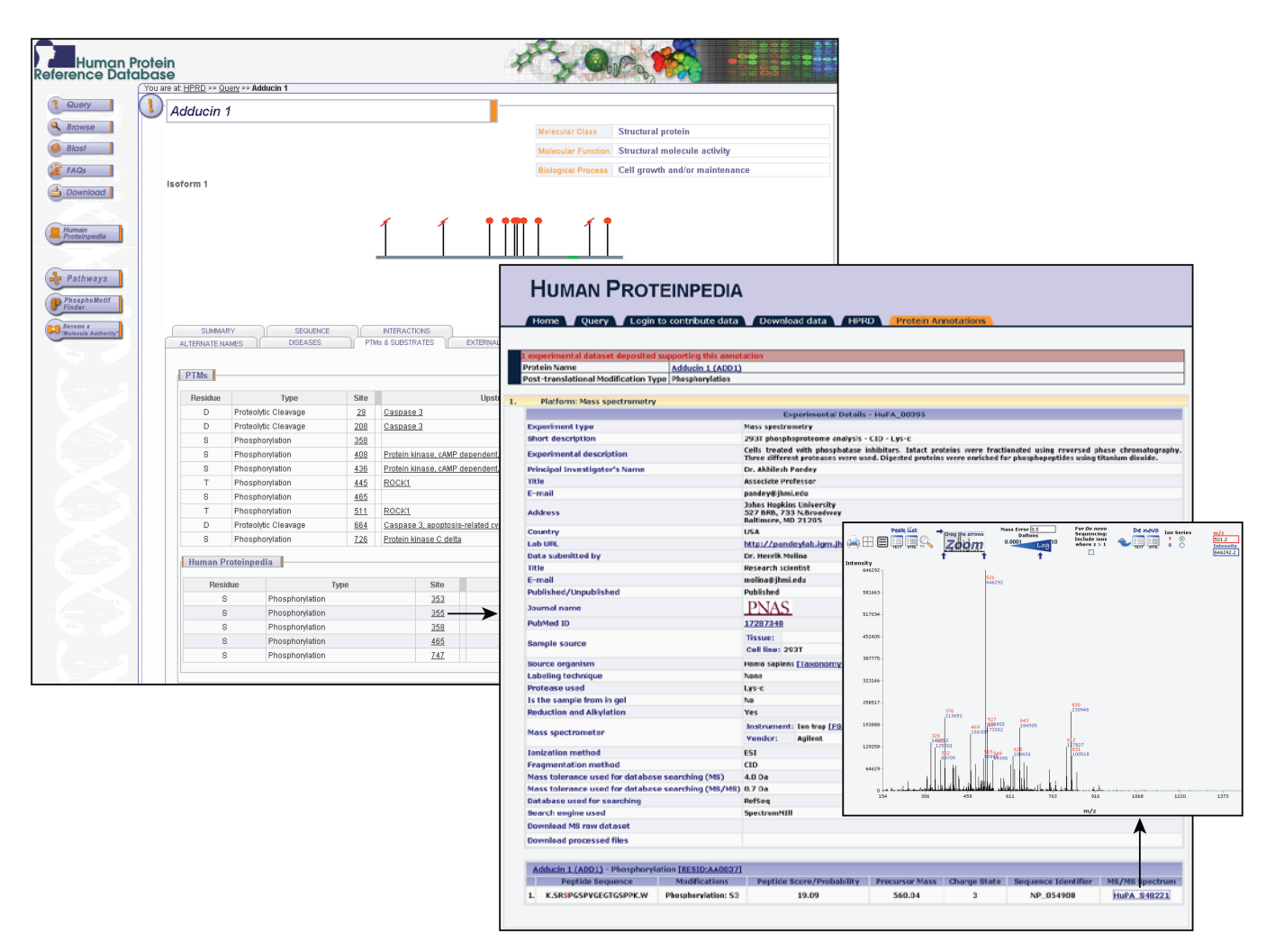
Figure 3. Display of PTM data in HPRD submitted through Human Proteinpedia. Adducin1 molecule page in HPRD shows five novel phosphorylation sites submitted through Human Proteinpedia. Phosphorylation sites are hyperlinked to Human Proteinpedia page with information on the investigator, laboratory and meta-annotation of mass spectrometry experiment. Corresponding MS/MS spectrum for a peptide is also displayed using spectrum viewer developed by PRIDE.

users to generate novel hypotheses or to point out likely molecules involved in a biological process of their interest. Further, the implementation of Human Proteinpedia has transformed HPRD into a community driven database and we hope that this trend will continue so that each and every entry is directly or indirectly verified by the individual experimentalists.