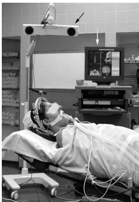
Figure 1 The navigation system includes a monitor and a computer, an optical digitising camera, a reference head frame, and specialised optical probes (not shown).