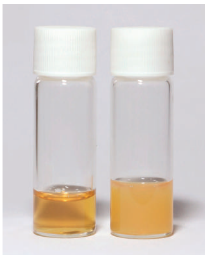
Figure 2 Comparison of patient's serum showing lipaemia (bottle on the right) with a control serum.

A 52 year old woman presented to the emergency department with two hours of central chest pain. She had no past medical history of ischaemic heart disease, diabetes, or hypertension. She had a family history of ischaemic heart disease; her brother had a myocardial infarction when 50 years old. She was taking no medication.