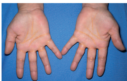
Figure 1 Patient's hands showing palmar striated xanthomas and yellowish discoloration along the palmar creases.