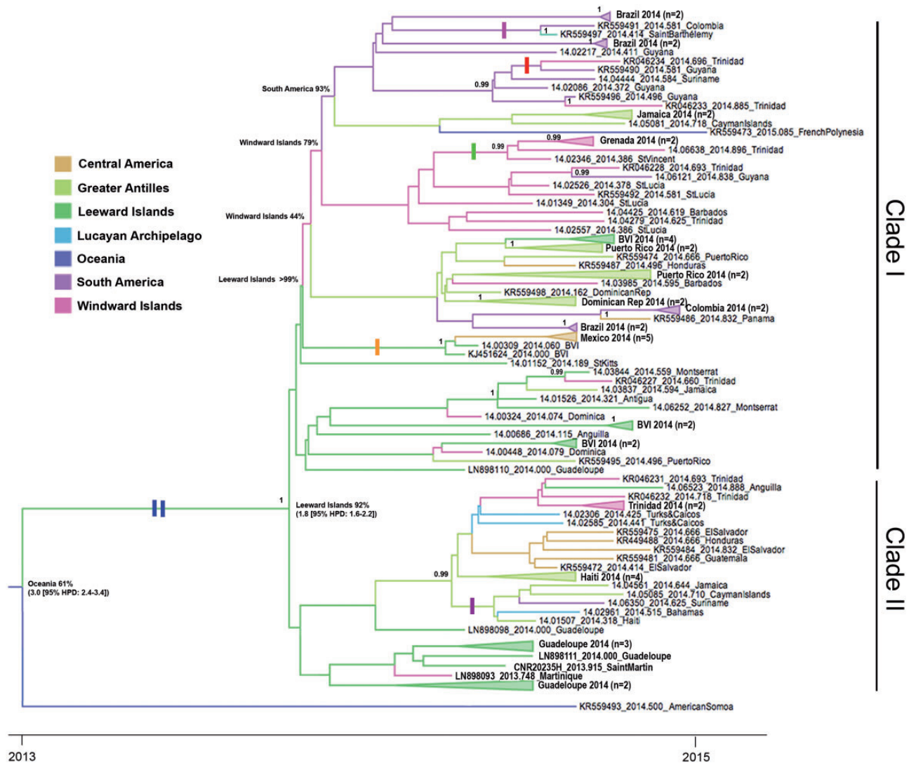
Figure 2. The Asian/American lineage and its most closely related sequence from American Samoa (2014). Taxon labels include year of isolation, accession number/sequence ID and country of isolation except in collapsed clades, which are comprised of two or more sequences from the same country and year. The number of sequences in each collapsed clade is shown in parentheses, (the accession numbers for sequences in these collapsed clades are shown in Supplementary Figure S2). Amino acid changes defining clades within the phylogeny are indicated by coloured bars on the relevant branches (blue = 6K L20M and E2 V368A; red = nsP4 R99Q; green = nsP4 H179Y; orange = E2 V113A, purple = nsP3 Stop521R; pink = E1 T101M). Terminal branches of the tree are colored according to the region to which the country from which the sequence at the tip was derived, i.e. Central America (Mexico); Greater Antilles (Cayman Islands, Dominican Republic, Haiti, Jamaica, Puerto Rico); Leeward Islands (Anguilla, Antigua, British Virgin Islands, Guadeloupe, Montserrat, Saint Barthélemy, St. Kitts and Saint Martin); Lucayan Archipelago (Bahamas and Turks & Caicos); Oceania (American Samoa, French Polynesia, Micronesia and New Caledonia); South America (Brazil, Colombia, Guyana and Suriname); Windward Islands (Barbados, Dominica, Grenada, Martinique, St. Lucia, St. Vincent and Trinidad). Internal branches are colored according to the most probable (model) location of their parental nodes and the location state probability is indicated as a percentage at selected nodes. Also at two selected nodes, in square brackets, are node ages and corresponding 95% HPDs. Nodes with posterior probabilities (clade credibilities) \geq 0.99 are labelled.

respectively. At position 4,424, a G \rightarrow A transition was observed resulting in a non-synonymous substitution (G117R) within the nsP3 protein. At nucleotide position 5,633, a T \rightarrow C transition was observed, which resulted in the replacement of an opal stop codon with an arginine residue at position 521 in the nsP3 peptide. This variant corresponded to the amino acid substitution observed in seven Caribbean sequences (see Table 1).